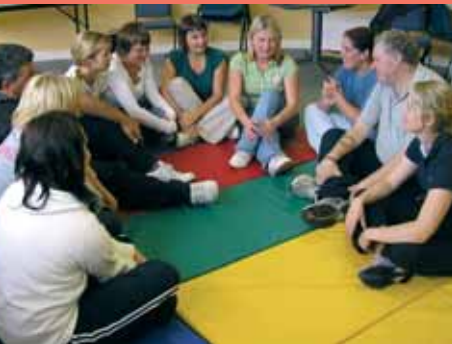
Participants on our Managing Challenging Behaviour training programme

Building on the success of the programme, we will be providing this training in 2007 for teachers from local schools.