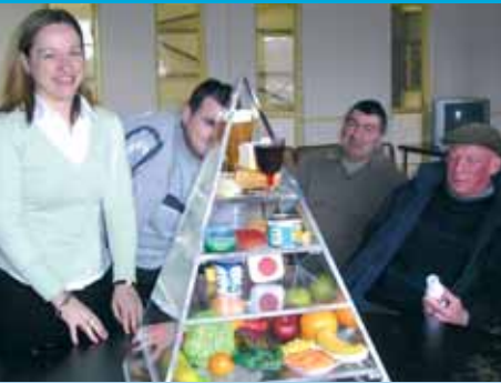
Men at the LEAP Project taking part in HSE healthcare course

13 people completed our first Considering Self-employment Programme. This new 12-week programme introduces the option of self-employment as a viable alternative to employment for people who are unemployed.