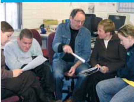
Participants on one of our Active Citizenship courses

Submissions to Wicklow County Council for input into their Local Anti Poverty Strategy.