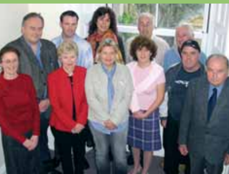
Members of the Board in 2006