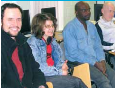
Participants on our Pre-Enterprise Training Programme for non-Irish nationals

We gave grants to nine community groups for activities such as arts and gardening for