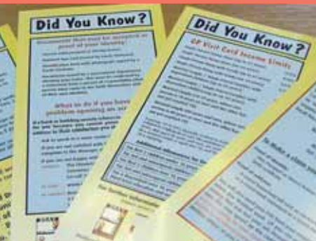
Did You Know information leaflets

Of course, information on these benefits was already available at national level. However, these local leaflets go one step further by providing contact numbers for local groups and agencies who can provide one-to-one support to individuals – to see if they are entitled to claim a particular benefit, and then to go through the steps of making the application.