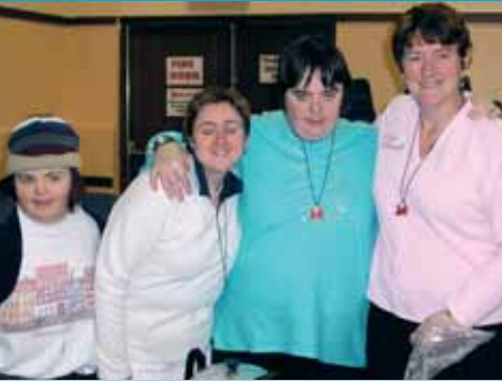
Women volunteers from Sunbeam House at one of our Community Lunches

We continued our support for the LEAP Traveller Men's Project, providing funding to employ a Co-ordinator and for project overheads. Our Employment Services staff also provided line management, outreach and facilitation supports. The project engaged with 107 Traveller men in 2006, providing a wide range of courses, including two Back to Education Initiative courses. In addition, some participants took part in research carried out to develop the Co. Wicklow Local Anti-Poverty Strategy.